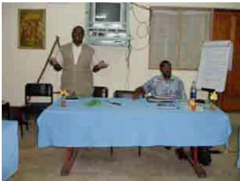
One of the training sessions that I conducted in Voi, coast province. I am seated on the right while one of the Agricultural Extension officers is addressing the farmer