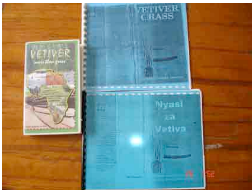
Copies of Vetiver grass book, both English and Swahili versions, and the video which were made and distributed to the farmers and the agricultural extension officers