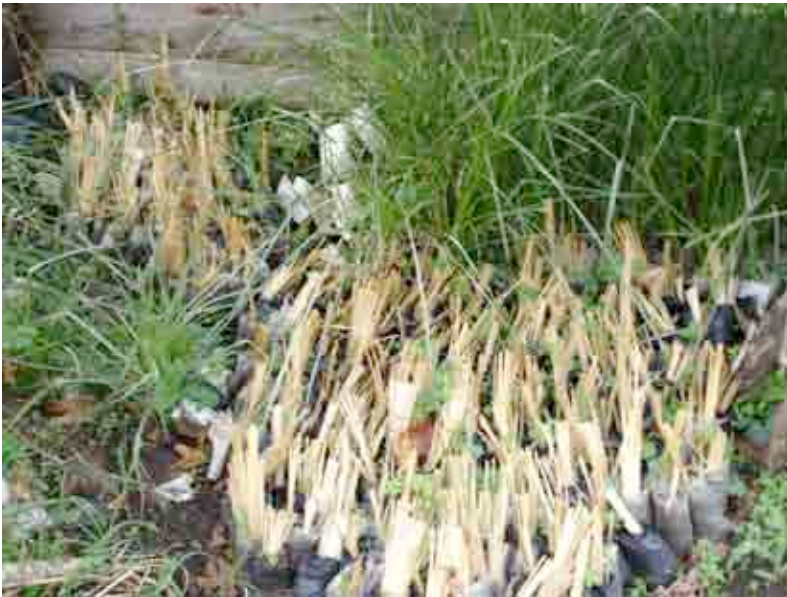
Vetiver grass nursery at Njoro. The chance