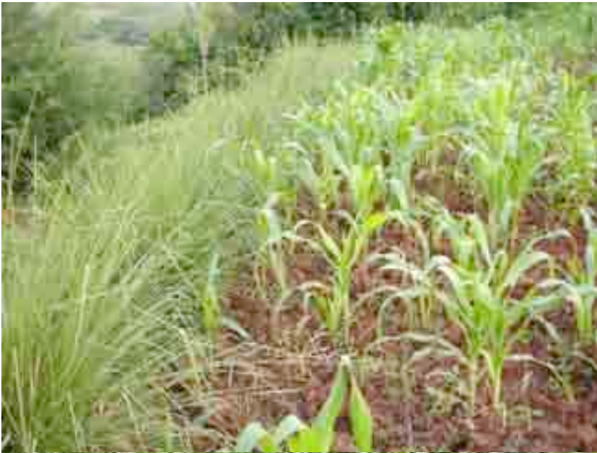
Vetiver grass in Mr Aggrey Ondieks farm in Nyanza province. Photo taken in June 2007